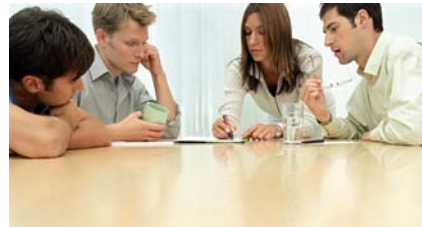
Watch the Free On-Demand Webinar Right Now!

and a discussion on the role of the executive director and board in leading the organization through the downturn. During the event, participants were asked to provide cost-reduction strategies and the top actions they plan to take going forward. The insightful feedback is compiled and is also available for download.